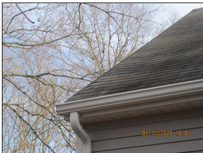
1.0 Item 1(Picture)

1.0 The roof covering is old, and the life of covering has expired. The covering does need to be replaced. While it could last a year or so, some areas may need patching with tar as leaks develop.