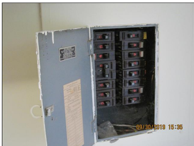
7.1 Item 1(Picture)

Main panel is missing a panel cover which is a safety hazard. Recommend placing panel cover and labeling circuit breakers.