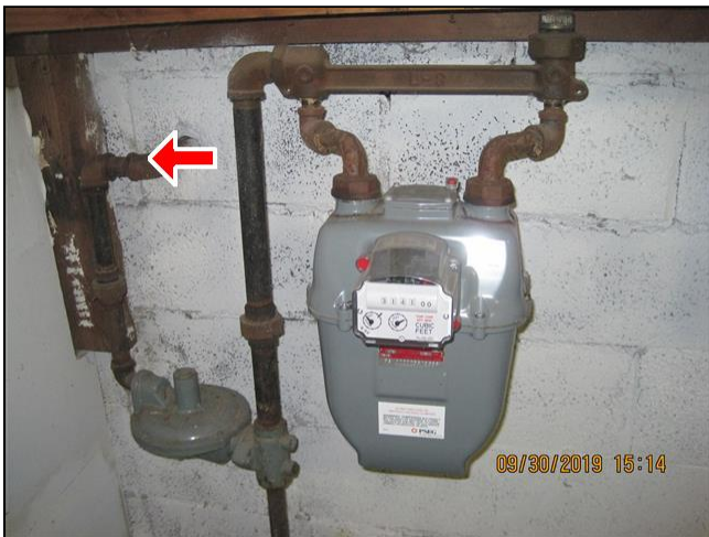
6.5 Item 1(Picture)

The plumbing in the home was inspected and reported on with the above information. While the inspector makes every effort to find all areas of concern, some areas can go unnoticed. Washing machine drain line for example cannot be checked for leaks or the ability to handle the volume during drain cycle. Older homes with galvanized supply lines or cast iron drain lines can be obstructed and barely working during an inspection but then fails under heavy use. If the water is turned off or not used for periods of time (like a vacant home waiting for closing) rust or deposits within the pipes can further clog the piping system. Please be aware that the inspector has your best interest in mind. Any repair items mentioned in this report should be considered before purchase. It is recommended that qualified contractors be used in your further inspection or repair issues as it relates to the comments in this inspection report.