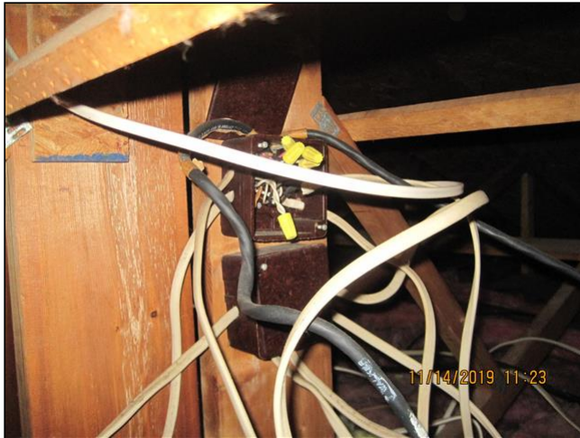
7.2 Item 1(Picture)