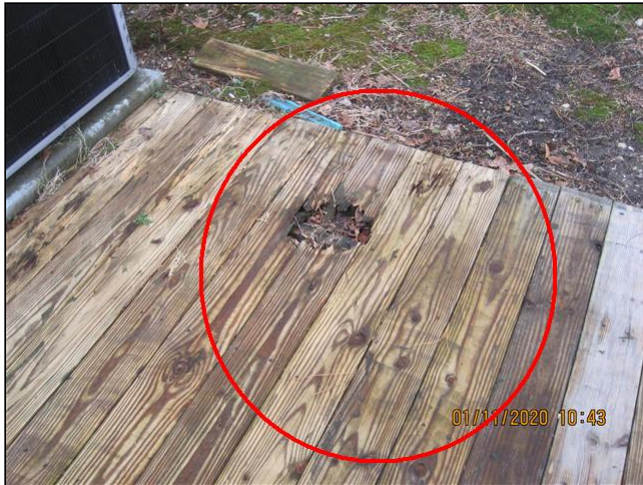
2.3 Item 1(Picture)