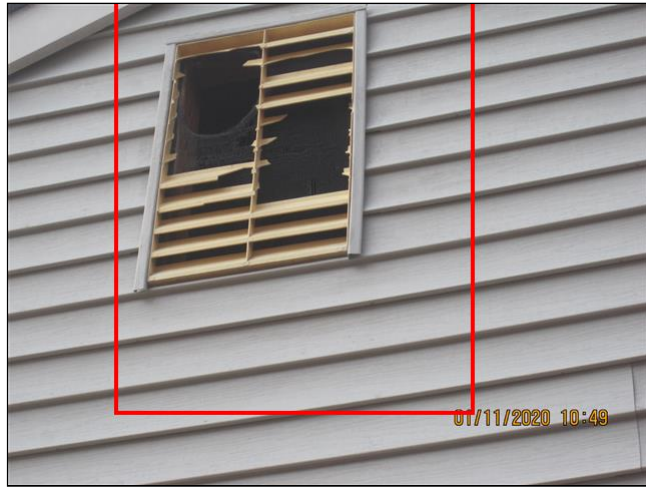
2.5 Item 2(Picture)

The exterior of the home was inspected and reported on with the above information. While the inspector makes every effort to find all areas of concern, some areas can go unnoticed. Please be aware that the inspector has your best interest in mind. Any repair items mentioned in this report should be considered before purchase. It is recommended that qualified contractors be used in your further inspection or repair issues as it relates to the comments in this inspection report.