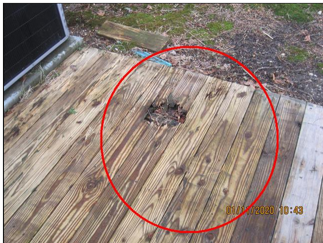
2.3 Item 1(Picture)

2.3 The deck is in poor condition and should be removed or replaced