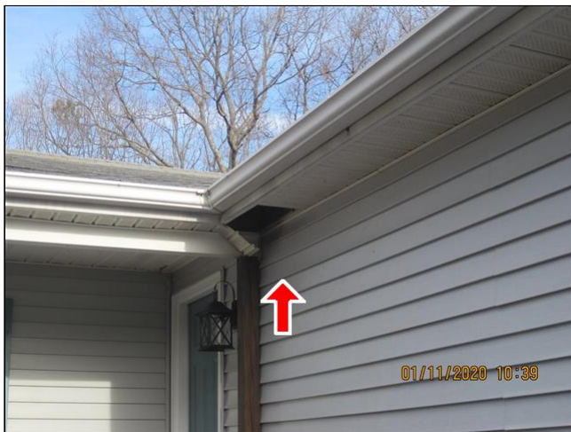
2.5 Item 1(Picture)

Soffit needs to be repair. Gable vent needs to be replace. Missing screen will be a entry point for animals and insects.