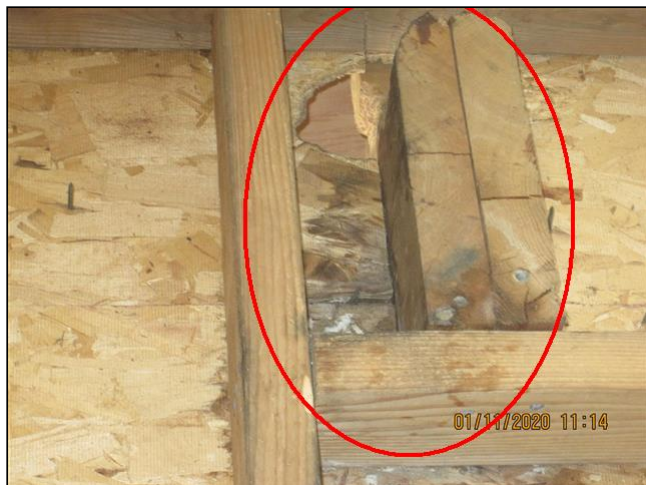
3.1 Item 1(Picture)