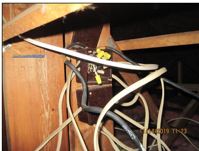
7.2 Item 1(Picture)

7.2 Open electric box in attic. Loose electric wire in basement.. Recommend calling a licensed professional to secure wires in attic and cover box. Terminate the loose electric wire in proper junction box.