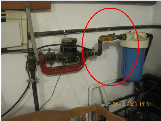
6.3 Item 1(Picture)