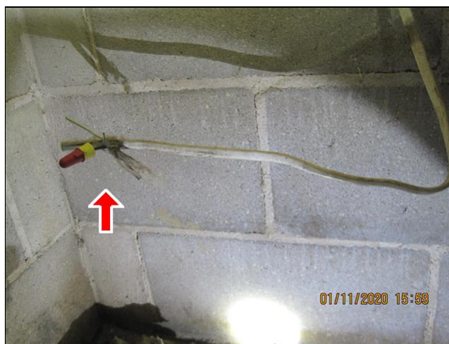
7.2 Item 2(Picture)