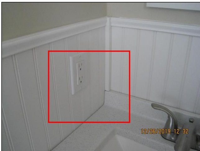
7.4 Item 1(Picture)

No GFCI present in main bathroom. Outlets within 6 feet of a water source needs to be GFCI protected. Recommend contacting a licensed professional to replace outlet with GFCI.