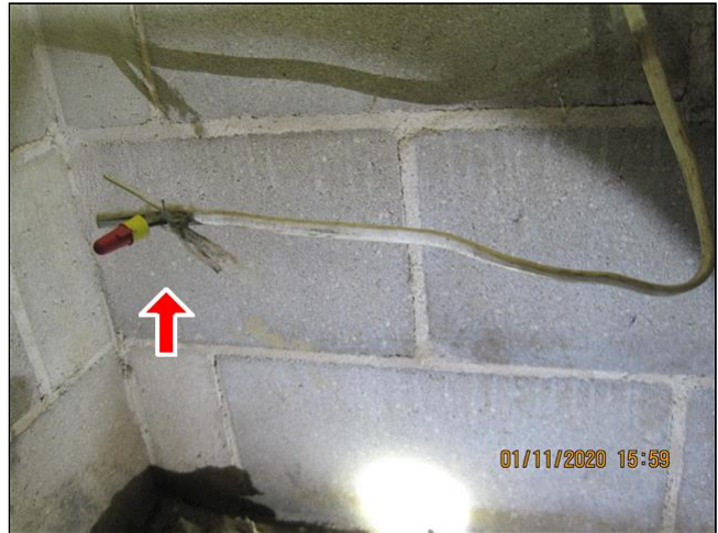
7.2 Item 2(Picture)